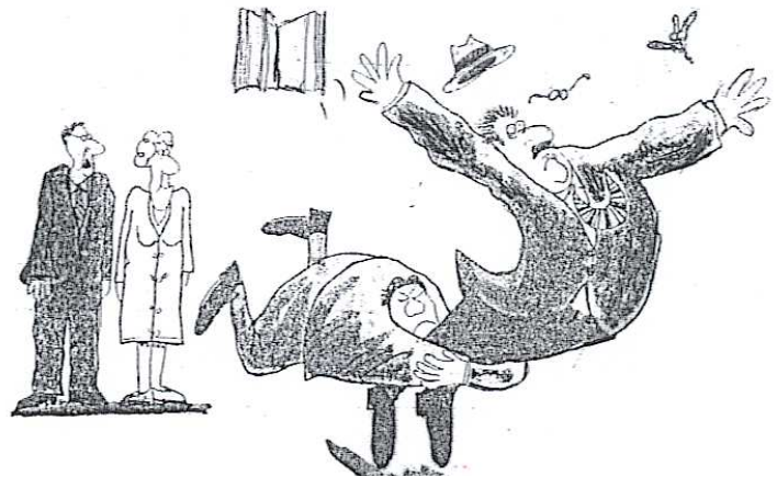
“Well, we do need new members.”